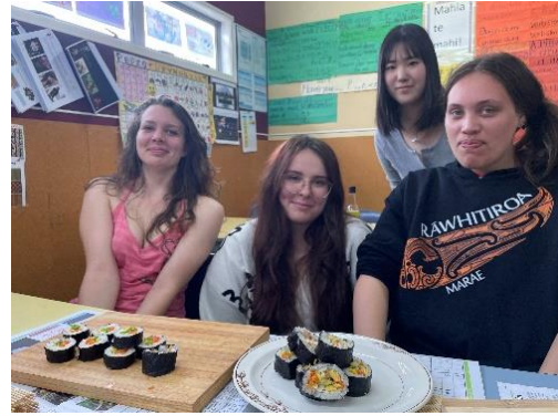
Japanese classes made Sushi on Cultural Day