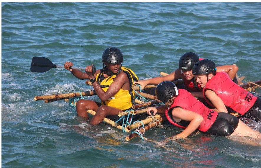
A NEWSLETTER TO PARENTS AND CAREGIVERS OF MORRINSVILLE COLLEGE